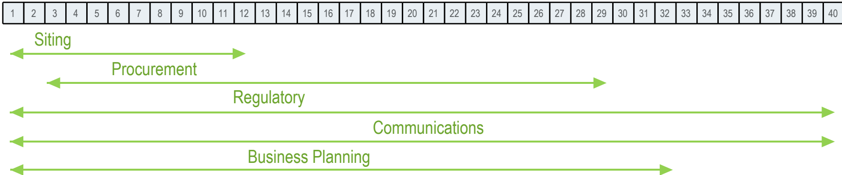
Estimated Number of Months Required

As illustrated below, some activities may be carried out in parallel with others.