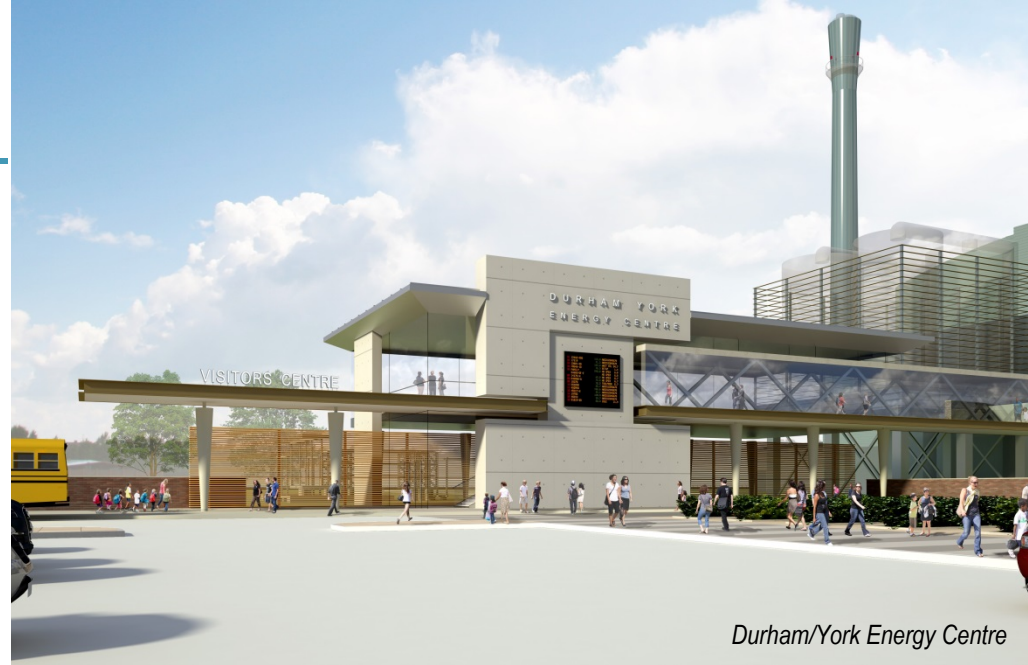
Durham/York Energy Centre

H-Power, Hawaii Lee County, Florida Union County, New Jersey Islip MacArthur RRF, New York Dutchess RRF, New York Baltimore RESCO, Maryland Etc.